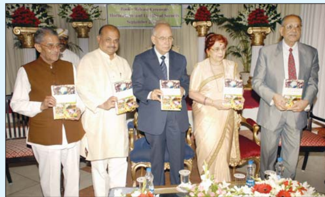
The Book-Horticulture and Livelihood Security is being released by Dr. Hans Raj Bhardwaj