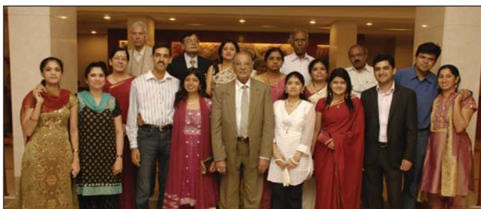
PNASF family at the get-together