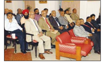
Audience during the book release ceremony

pioneered the minute-to-minute programme of the function was the Master of the Ceremony.