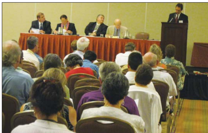
Presidential address during ASHS 2010 Annual Conference