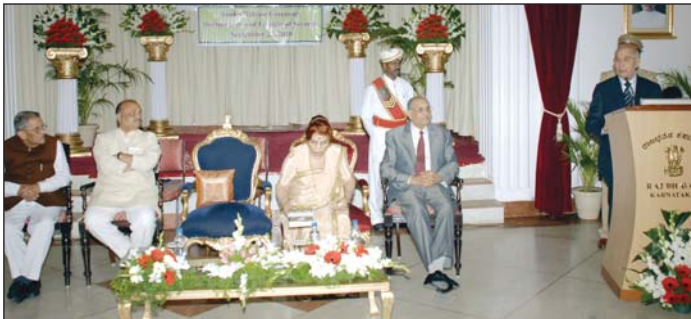
Dr. Hans Raj Bhardwaj H.E. the Governor of Karnataka addressing the gathering

Addressing the distinguished and elite gathering after release of the book, Dr. Hans Raj Bhardwaj appealed to horticultural and agricultural universities and research institutes involved in agriculture research to intensify their research in horticultural crops for higher yields and increased nutritional values. Even though India is producing fruits and vegetables, the production is far below to meet the requirements of the growing population. In the changing climatic conditions and changing dietary pattern of the people, efforts need to be made to popularise the advanced technologies in optimum utilisation of water, nutrients and high yielding cultivars, said Dr Bhardwaj and called upon the research workers to come out with viable and sustainable production technologies for small and marginal farmers and the peasants. He further appreciated the yeoman services of PNASF, Bangalore in the field of agriculture and allied sectors and wished all the successes in its future endeavours.