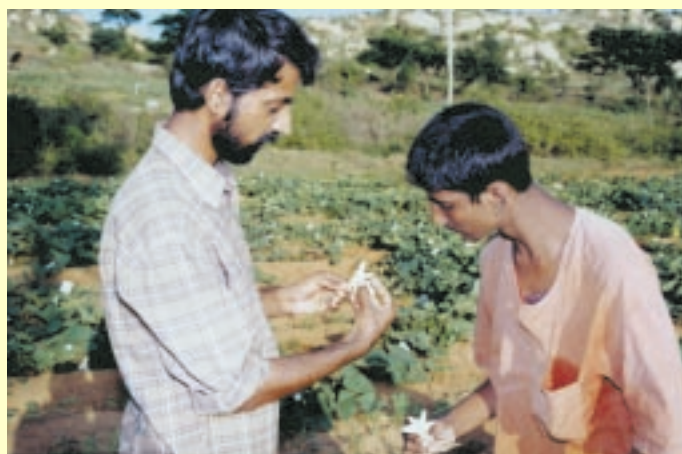
An instructor educating mentally challenged in hybridisation technique