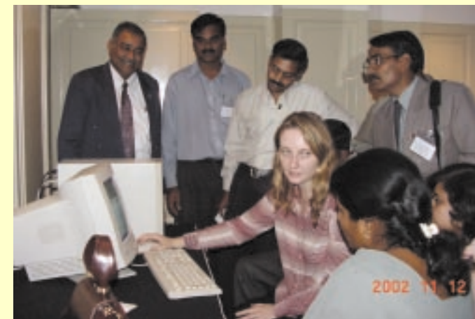
Hortivar Training Programme during ICV 2002

PNASF sponsored a sum of Rs. 10,000/- to the ICAR National Potato Workshop for documentation held at the University of Agricultural Sciences, Hebbal, Bangalore, India from 5-7 September, 2003.