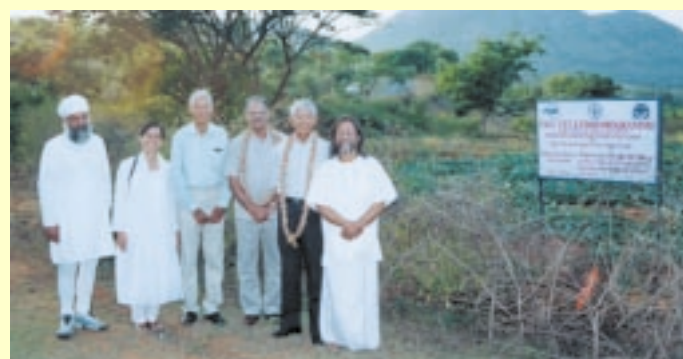
Launching of FAO Telefood Project