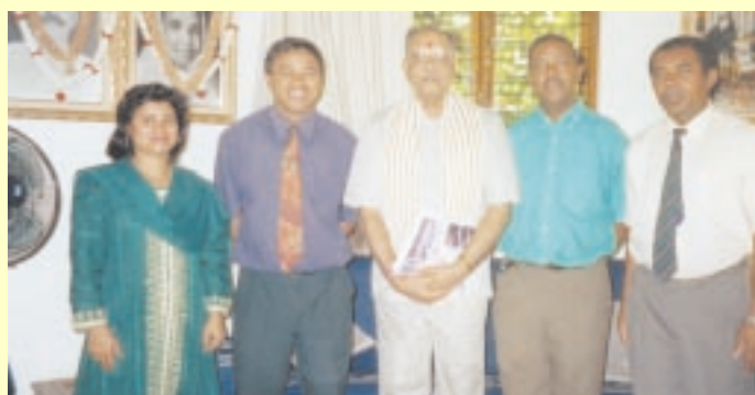
Visit of Madagascar Study Team

In appreciation of the assistance and support provided by the PNASF, Bangalore, India, to Princess Maha Chakri Sirindhorn Foundation in all out efforts to support appropriate programmes and projects in rural development to fulfill the desire of His Majesty King Bhumibol Adulyadej of Thailand for his people to maintain a subsistence level of living and to eventually become self reliant, Her Royal Highness, Princess Maha Chakri Sirindhorn, Thailand awarded an 'Insignia' (bearing HRH initials) to Dr. Prem Nath Agricultural Science Foundation, Bangalore, India.