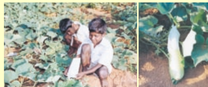
Mentally challenged children enjoying pollination work (bagging) and a bottle guard grown by them for seed production.